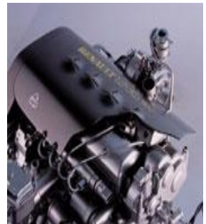
Automobile sound absorbers

Cosmonate CG-3200 is a special modified MDI, which is used for a wide variety of purposes in the automobile and furniture sectors. With good elongation and setting characteristics, it can improve workability. With excellent flowability and moldability, it is advantageous in making automobile seats, health pillows, and integrated automobile headrests that are made using complex molds.